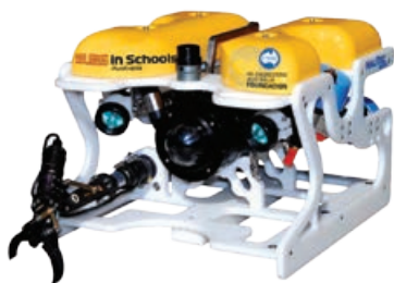
Level 2 - Large ROV

Professional Class: Professional class is an open design category where the students in years 7-12 have the freedom to design and build their own ROV in compliance with the Technical Regulations.