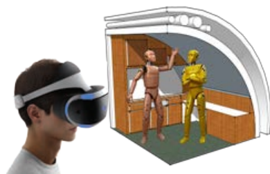
Level 3 - Spatial Design

The task is to form a virtual design company, which will make a bid for the design of an accommodation space on-board a future submarine project. The students will then bring this design into a virtual reality environment to demonstrate their design. This level is designed for students in years 7-12 and is well suited to schools who do not have a significant workshop facility.