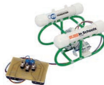
Level 1 - Mini ROV

Is designed for students in years 5-8 as an introduction to STEM and underwater vehicle operation. The task is to build and operate a Mini ROV with the focus being on learning the principles of buoyancy, propulsion and control. Small ROV model kits, together with instructions, are made available to the schools.