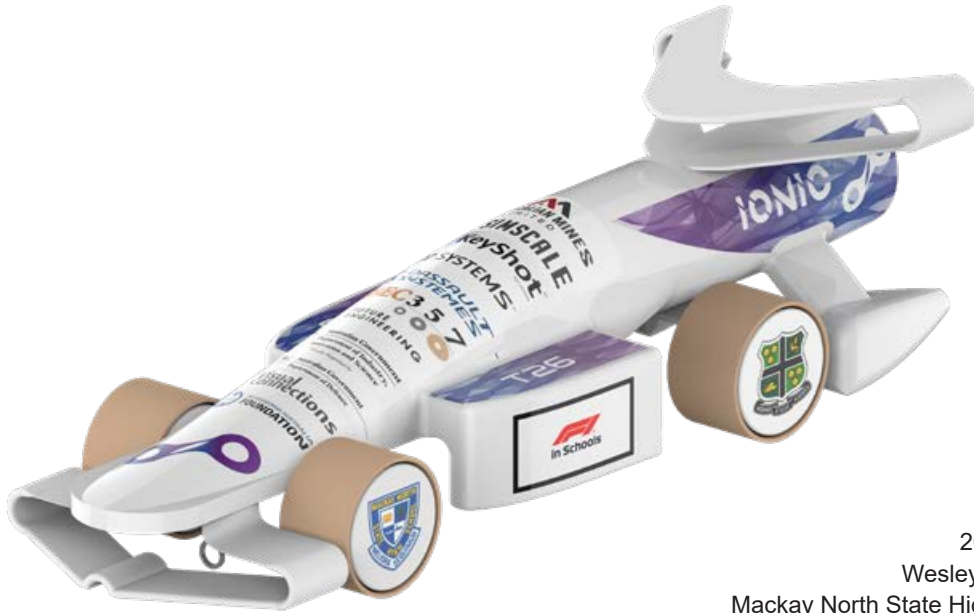
IONIC - 9th 2019 World Final Wesley College, WA & Mackay North State High School, QLD